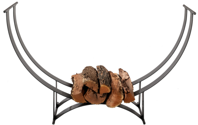
48-inch Wood Rack All-Weather Cover