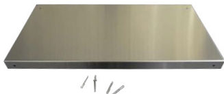
Stainless Steel Shelf Cover 20 x 42